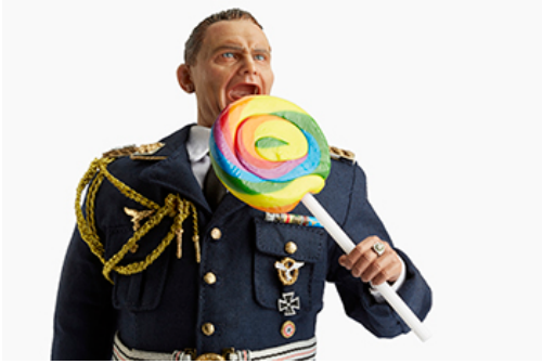
Jim Riswold (American, b. 1957), "Göring's Lollipop," 2014-15, color digital print, 40 x 60 inches, courtesy of the artist and Augen Gallery, Portland, Oregon.