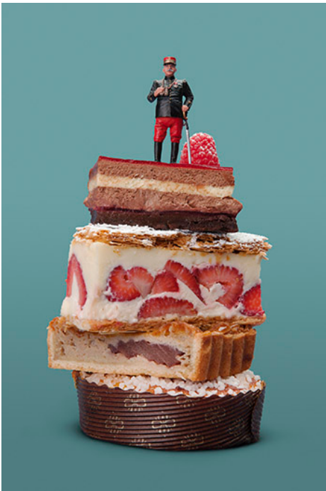
Jim Riswold (American, b. 1957), "French Pastry Joffre," 2012, color digital print, 53 x 40 inches, courtesy of the artist and Augen Gallery, Portland, Oregon.