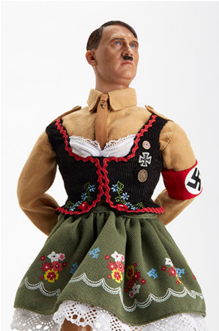
Jim Riswold (American, b. 1957), "Beer Hall Putsch Hitler (1923)," 2014-15, color digital print, 60 x 40 inches, courtesy of the artist and Augen Gallery, Portland, Oregon.