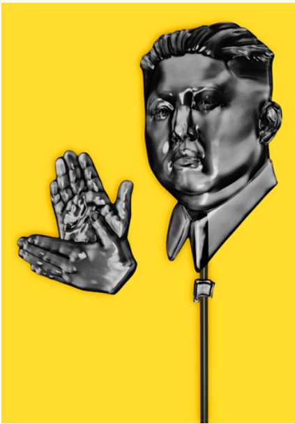
Jim Riswold (American, b. 1957), "Kim Jong-Un is a Big Fat (Licorice) Sucker!," 2014, color digital print, 28 1/4 x 20 inches, courtesy of the artist and Augen Gallery, Portland, Oregon.