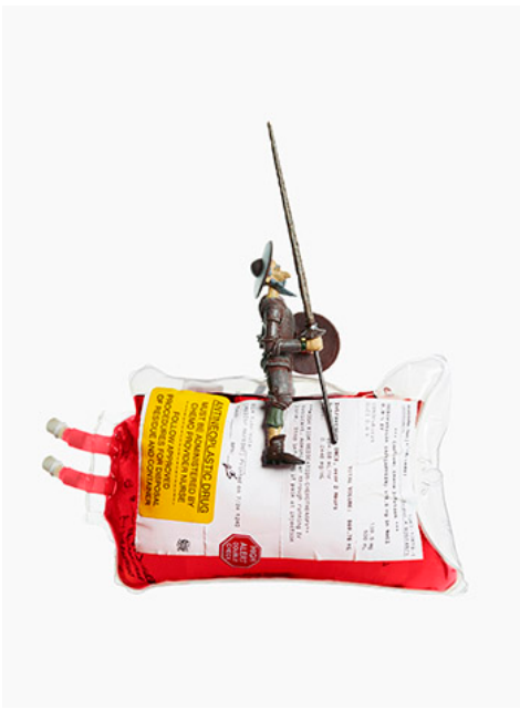
Jim Riswold (American, b. 1957), "Don Quixote Fights Cancer)," 2013, color digital print, 54 x 40 inches, courtesy of the artist and Augen Gallery, Portland, Oregon.