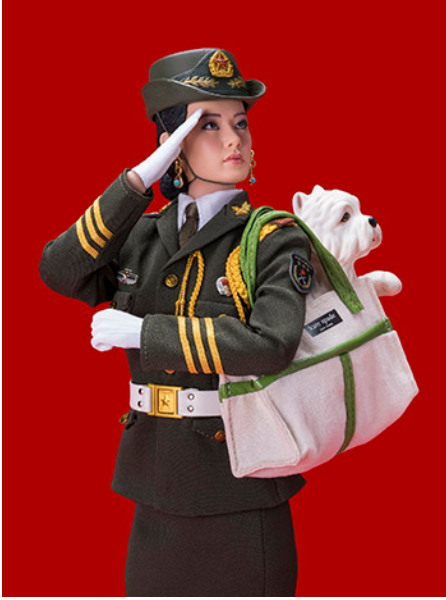
Jim Riswold (American, b. 1957), "Red Chinese Doll (in Kate Spade)," 2015-16, color digital print, 40 x 30 inches, courtesy of the artist and Treason Gallery, Seattle, Washington.