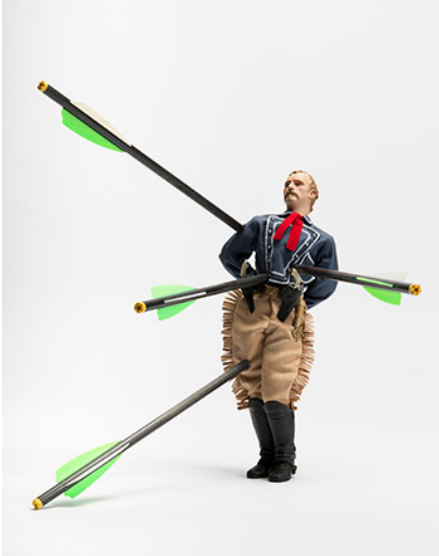
Jim Riswold (American, b. 1957), "St. Custer (After Rubens)," 2017, color digital print, 29 1/2 x 24 inches, courtesy of the artist and Augen Gallery, Portland, Oregon.