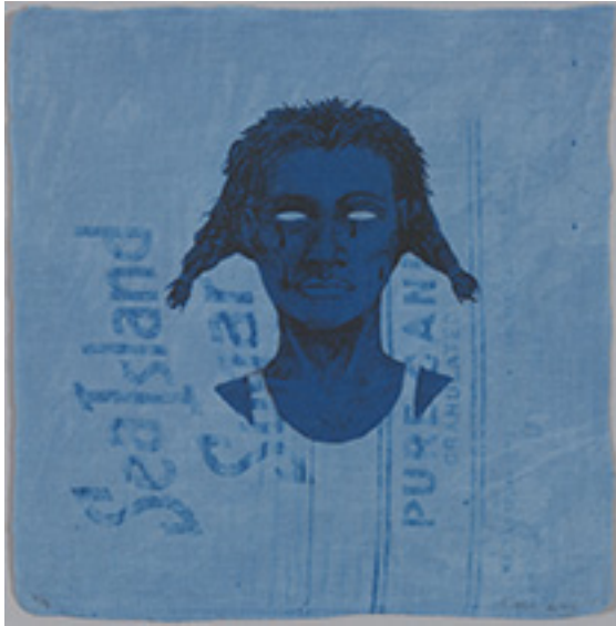
Alison Saar (American, b. 1956), "Indigo Blue (Sea Island Pure)," 2016, ed. 2/3, intaglio, 12 x 11 3/4 inches, Collection of Jordan D. Schnitzer, 2016.90.

For a High Resolution Version call 503-370-6867 or email museum-art@willamette.edu