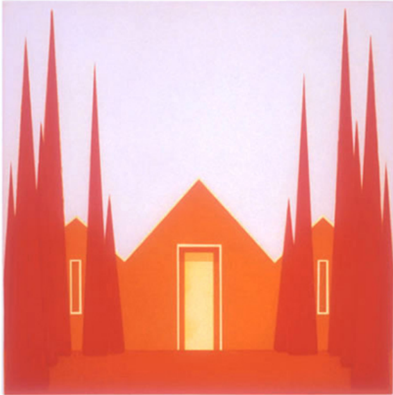
Salomon Huerta (American, b. 1965), "Untitled (Vermillion House)," 2004, ed. 4/30, color aquatint etching with drypoint, 35 1/4 x 35 1/4 inches, Collection of the Jordan Schnitzer Family Foundation, 2004.200.

For a High Resolution Version call 503-370-6867 or email museum-art@willamette.edu