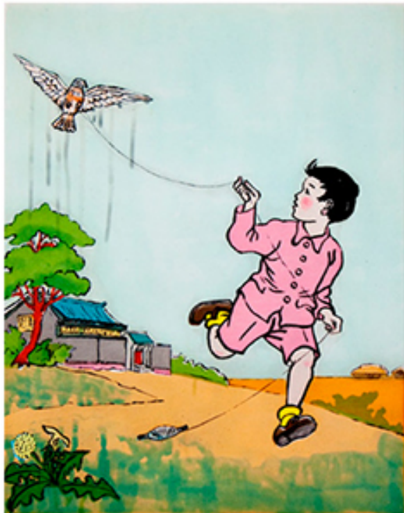
Hung Liu (American, b. China, 1948), "Happy and Gay: The Kite," 2012, ed. 4/20, color aquatint etching, 24 x 20 inches, Collection of Harsch Investment Properties, 2013.36.

For a High Resolution Version call 503-370-6867 or email museum-art@willamette.edu