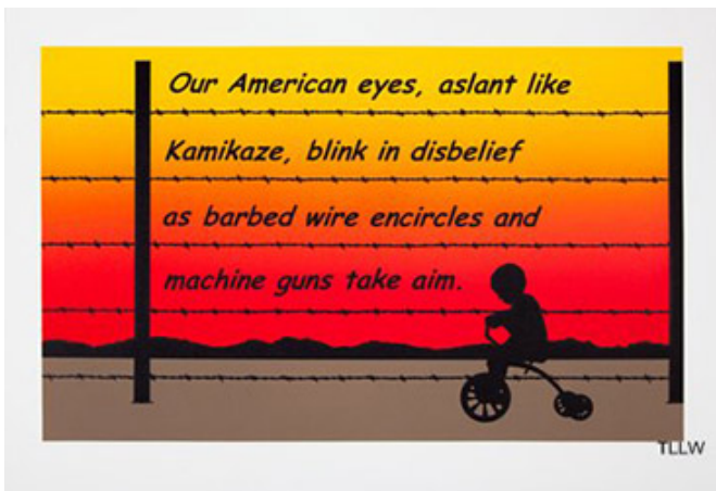
Roger Shimomura (American, b. 1939), "Nisei Trilogy: The Camps," 2015, ed. 4/50, lithograph, 18 1/2 x 27 inches, Collection of Jordan D. Schnitzer, 2015.794b.

For a High Resolution Version call 503-370-6867 or email museum-art@willamette.edu