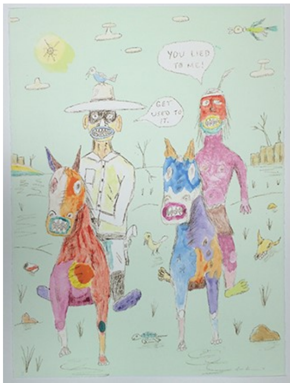
Jim Denomie (Ojibwe, b. 1955), "Untruthful," 2011, ed. 1/1, monoprint, 29 3/4 x 22 1/8 inches, Collection of Jordan D. Schnitzer, 2015.817.

For a High Resolution Version call 503-370-6867 or email museum-art@willamette.edu