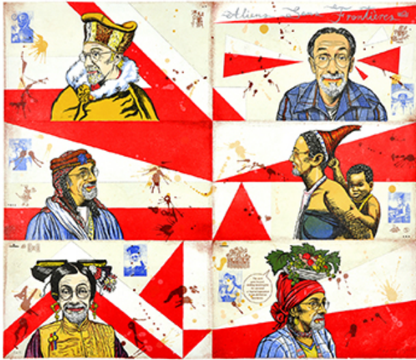
Enrique Chagoya (American, b. Mexico, 1953), "Aliens San Frontières," 2016, ed. 12/30, color lithograph, 24 x 28 inches, Collection of Jordan D. Schnitzer, 2016.298.

For a High Resolution Version call 503-370-6867 or email museum-art@willamette.edu