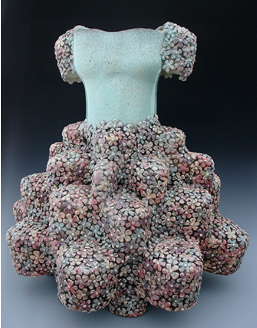
George Rodriguez (American, b. 1982), "Confetti," 2012, ceramic with glaze and acrylic, 28 x 28 x 28 in., courtesy of the artist and the Foster/White Gallery, Seattle, WA. Photo: George Rodriguez

| A high resolution version is available upon request by calling 503-370-6867 or email afoust@willamette.edu |