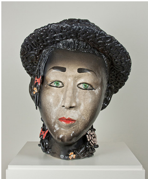
George Rodriguez (American, b. 1982), "Boy," 2011, ceramic with glaze, 20.5 x 16.5 x 15 in., private collection.

| A high resolution version is available upon request by calling 503-370-6867 or email afoust@willamette.edu |