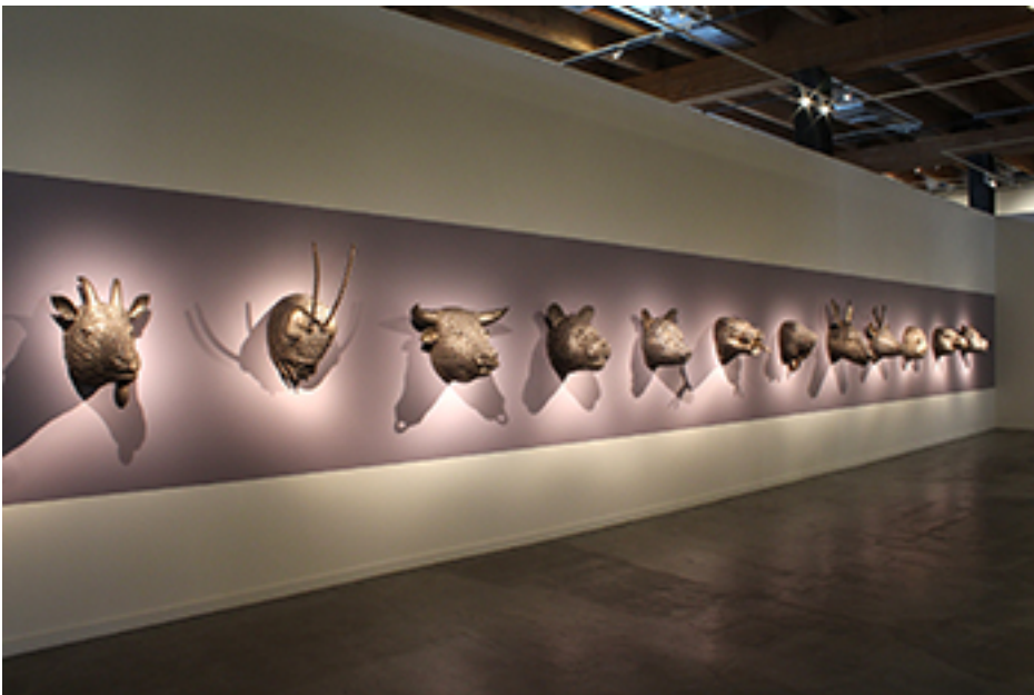
George Rodriguez (American, b. 1982), "El Zodíaco Metálico," 2019, ceramic with glaze, private collection.

| A high resolution version is available upon request by calling 503-370-6867 or email afoust@willamette.edu |