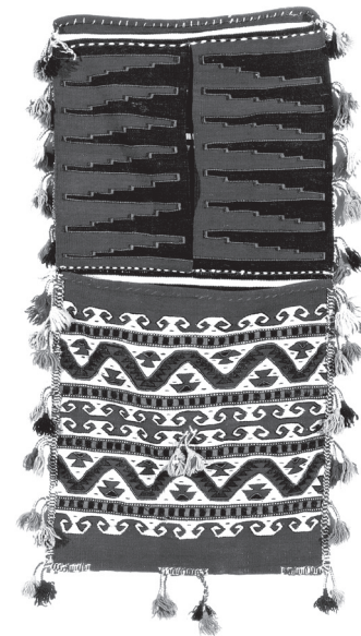
Heybe/saddle bag, Central Turkey, 20th century