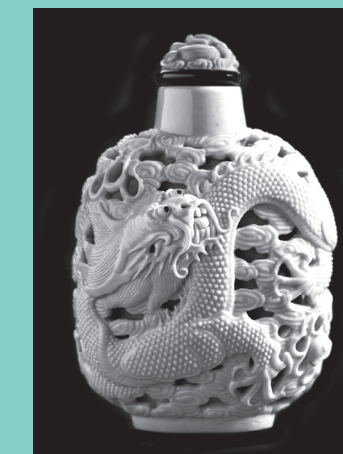
Snuff bottle, Chinese, Qing Dynasty (1644–1912)