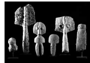
Stone Heads, Bura, Niger, 3rd–11th century

Stone sculpture is among the oldest sculptural traditions in Africa, dating back thousands of years. At sites such as Bura in Niger, for example, archaeologists have unearthed an astonishing array of abstract, anthropomorphic heads in stone, while at other sites in West Africa, they have discovered figurative sculptures whose purpose and function remains a mystery.