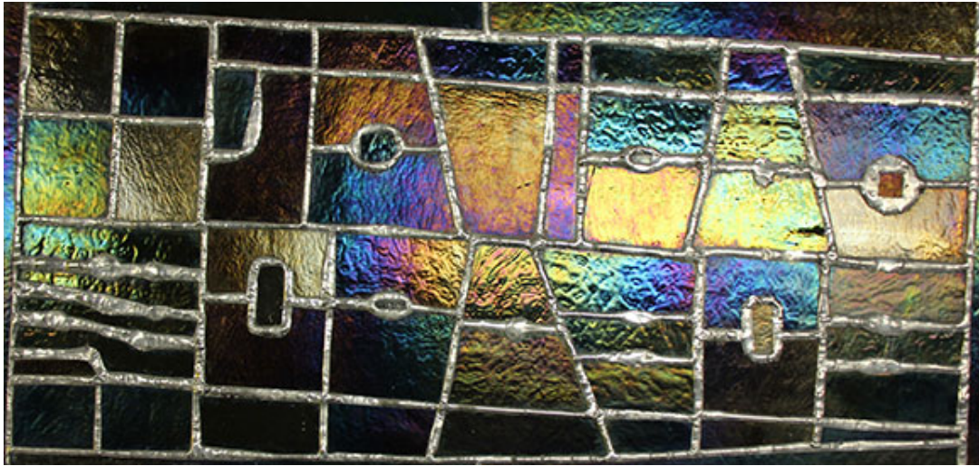
Chelsea Couch (American, born 1990), YOU ARE NOWHERE (detail) , 2021-22, Bullseye glass, leaded solder, stainless steel chain, 84 x 120 in., overall, courtesy of the artist.