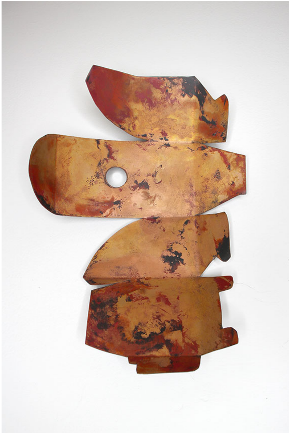
Chelsea Couch (American, born 1990), Stopover (detail), 2021-22, copper plates, found lamp, vintage fur, 4 x 36 x 7 in., overall, courtesy of the artist.