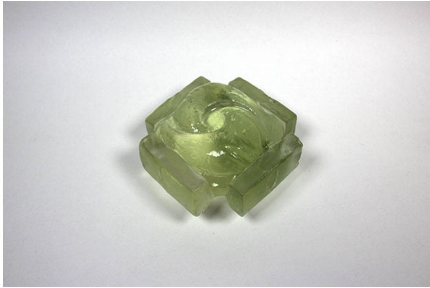
Chelsea Couch (American, born 1990), PodPod , 2022, cast Bullseye glass Tide pod, Juul pods, 36 x 36 x 2 in., courtesy of the artist.