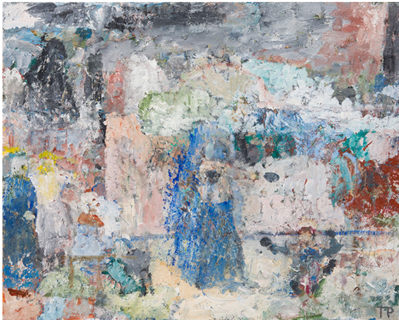
Tom Prochaska (American, born 1945), "Blue Boxer," 2016, oil on panel, 16 x 20 inches, private collection.