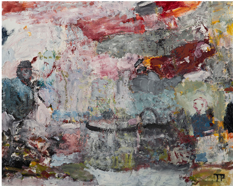
Tom Prochaska (American, born 1945), "Café," 2021, 16 x 20 inches, oil on panel, private collection.