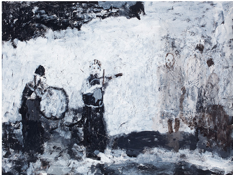
Tom Prochaska (American, born 1945), "Music for Ghosts," 2011, acrylic on panel, 12 x 16 inches, private collection.

For high-resolution images contact Andrea Foust at 503-370-6867 or at afoust@willamette.edu