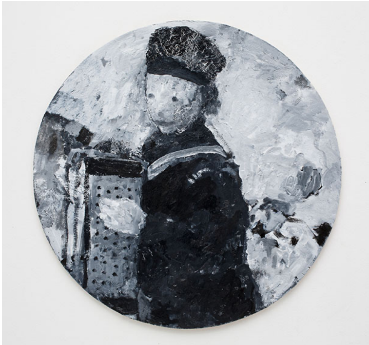
Tom Prochaska (American, born 1945), "Boy with Accordion," 2017, oil on panel, 23 inch diameter, courtesy of the artist and Froelick Gallery.