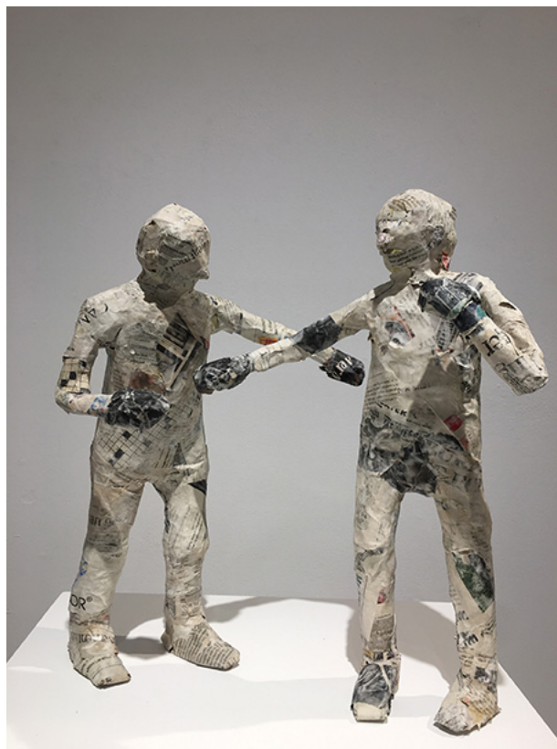
Tom Prochaska (American, born 1945), "Boxer 1 and Boxer 2," 2017, papier-mâché, 17 x 11 x 6 inches, private collection.