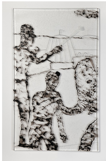
Tom Prochaska (American, born 1945), "Circus Magic," 2003, kiln-formed glass, 40 x 24 inches, collection of Bullseye Glass Co.