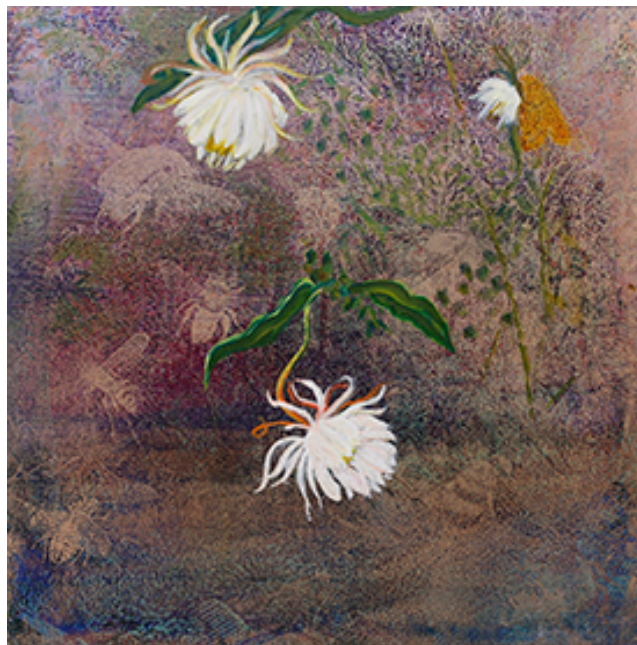
Rita Robillard (American, born 1944), Queen of the Night I , from the series Flower Serenade: A Gift of Time , 2021, screenprint and oil on panel, 18 x 18 inches, courtesy of the artist and the Augen Gallery.

For high-resolution images contact Andrea Foust at 503-370-6867 or at afoust@willamette.edu