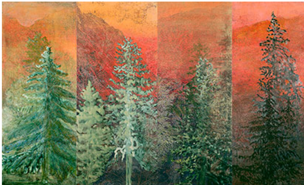
Rita Robillard (American, born 1944), Pillars: Trees in the Hills , from the series And Then Again: Rifts on the Forest and Time , 2017, screenprint and acrylic on panel, four prints, 28 x 12 inches each, collection of Freda Sherburne.