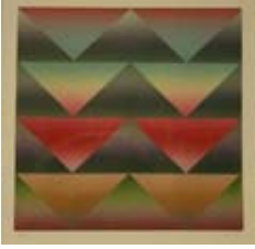
Joe Feddersen Glyph #6 2001 Unique linocut 11 x 9 ¾ in Courtesy of the Artist and Froelick Gallery, Portland, Oregon

I wanted to do something that is about printmaking. At the same time, I wanted to do something about home.