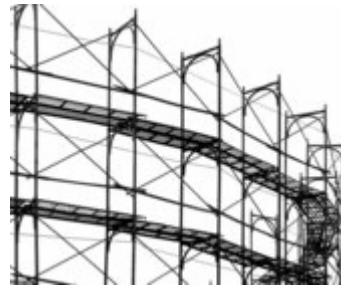
Joe Feddersen Scaffolding 2004 Woven waxed linen 5 ½ x 4 x 4 in