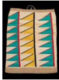
Artist unknown Cornhusk bag (front and back view) Plateau, ca 1900 Cornhusk, hide, thread 21 ½ x 17 in. Collection of the Hallie Ford Museum of Art, The Bill Rhoades Collection, a Gift in Memory of Murna and Vay Rhoades